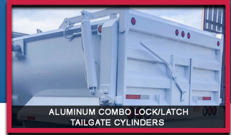
ALUMINUM COMBO LOCK/LATCH TAILGATE CYLINDERS