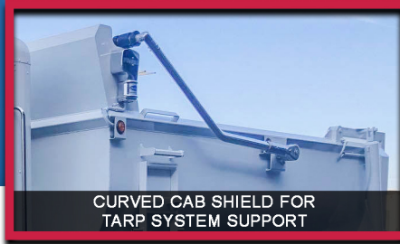
CURVED CAB SHIELD FOR TARP SYSTEM SUPPORT