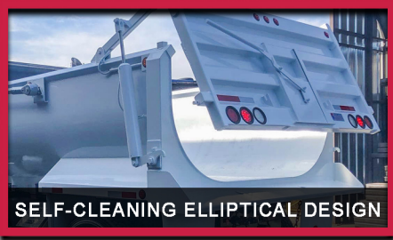
SELF-CLEANING ELLIPTICAL DESIGN

Since 1972, Spartan Truck Company has been the market leader in manufacturing waste equipment on the west coast. We are proud of our quick lead times, high quality components, & extremely durable Roll-Off systems, trailers and waste bodies