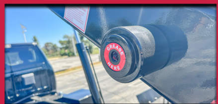
INTEGRATED RAIL ROLLERS