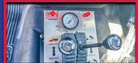
SIMPLE ERGONOMIC CONTROLS