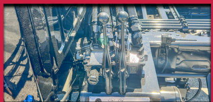
HIGH QUALITY HYDRAULIC COMPONENTS

Since 1972, Spartan Truck Company has been the market leader in manufacturing waste equipment on the west coast. We are proud of our quick lead times, high quality components, & extremely durable Roll-Off systems, trailers and waste bodies